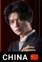
CHINA HONGBO CAI PIANO